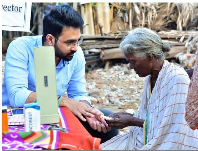
A volunteer physician in one of our weekend Mobile Medical Clinics

Why don't they vaccinate the poor in India? There is a limited amount of the vaccine in India, but unlike in the US it is not free. The cost is US$ 4.00 per shot or more than a full day wage for the poor. And what about medical and hospital care if you are poor and you contract Covid? We hold mobile medical clinics on weekends in the slums for the poor with local Doctors donating their time, but this is only "a micro drop in the bucket" of this need!